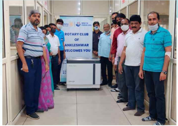
Cryobath Machine at Blood Bank