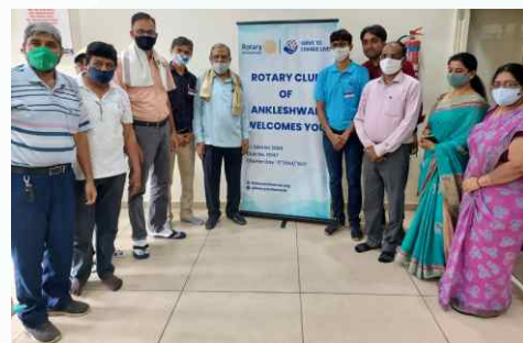
Facilitation of Dr on Dr Day.