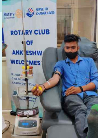
Blood donation camp