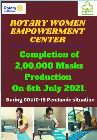
Women Empowerment Centre