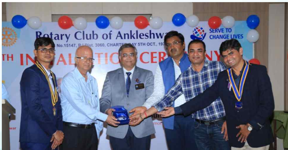
Jhagadia Industries Association