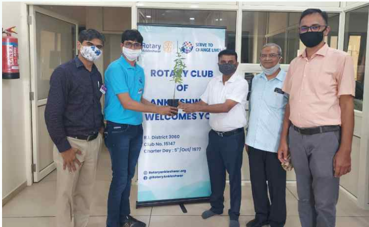
Chandan Tree Distribution.