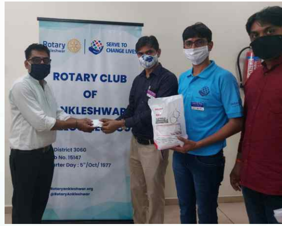
Mask Distribution. Project no 5